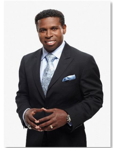
Keynote Speaker: Michael "Pinball" Clemons